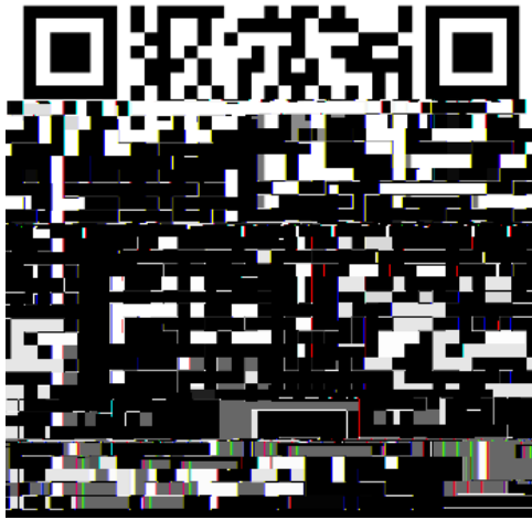
Website QR Code