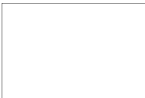
Figure 2. "Degradation" often is visible to the naked eye.

Glove compatibility charts are available from most manufacturers of PPE. Often they are given in a company's catalogue, so you can check compatibility before you order. Appendix D of CWRU's Chemical Safety Manual has an abbreviated chart; and our website ( http://does.cwru.edu ) also offers links to various companies' glove compatibility charts.