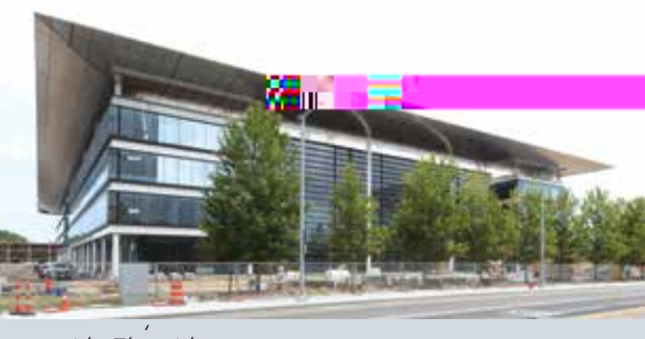
- 1, 7 - KI TK 1 - MIF